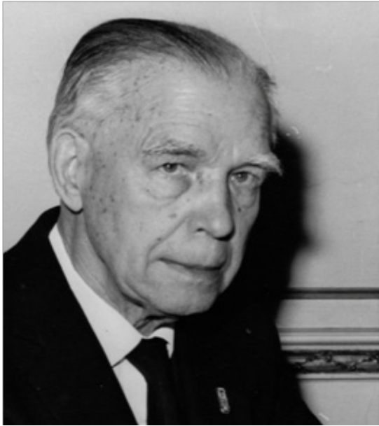
Figure 4. President Stanisław Ostrowski President of Polish Republic on Exile - portrait photo. (President Stanisław Ostrowski's Family Collection - with courtesy and permission of Jan Ostrowski).