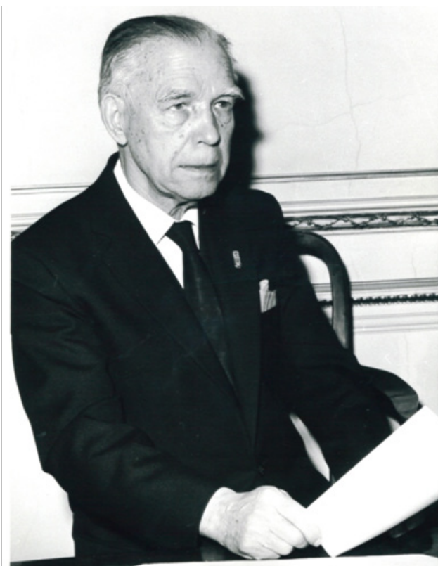
Figure 5. Stanisław Ostrowski President of Polish Republic on Exile on the day of presidential oath and taking an office of the Head of the State on 9th April 1972.