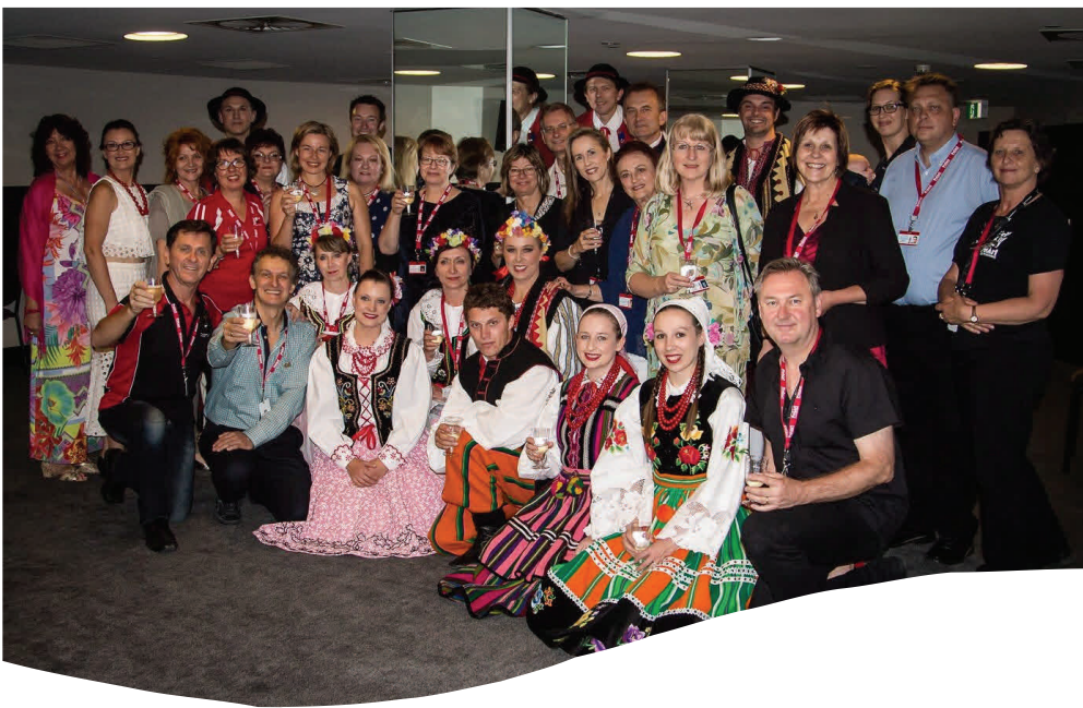
The PolArt "family" with the Melbourne PolArt Steering Committee at the Gala concert at Hamer Hall, during PolArt 2015 Melbourne

With a big push from the organisation for transparency, member organisations will receive PolArt Inc. quarterly newsletters and be included on our newly launched online social network group where they will receive most current information.