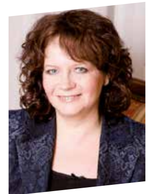
Professor Barbara Kudrycka Minister of Science and Higher Education

For students from outside the European Union who come to study in Poland, this may well mark the beginning of the fascinating adventure of discovering Europe: being invited to study in Poland means that you are invited to the European Union, of which Poland is an active member state. We invite you to discover the European Union, which offers not only varied, interesting cultures and the opportunities associated with strong, innovative economies, but also provides excellent conditions for successful higher education in a challenging and friendly atmosphere. With top-quality, internationally recognized degrees, almost no other region in the world can set your career off on such a promising start. This guide will provide you with the information you need to begin. Come to the European Union. Start from Poland!