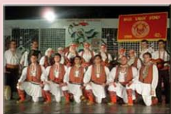
MACEDONIAN DANCE ENSEMBLE ILINDEN