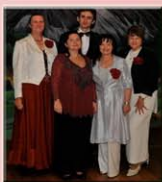
JOHN PAUL II MUSIC ENSEMBLE