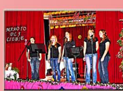
POL - HOP