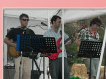
ODD MAN IN BAND