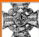
POLISH SCOUTING ASSOCIATION IN ASHFIELD