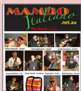
MAMBO ITALIANO BAND